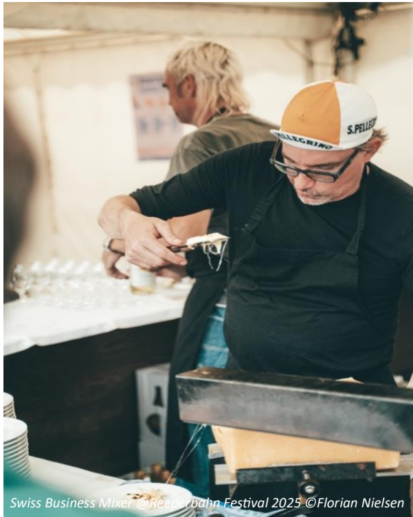
Swiss Business Mixer